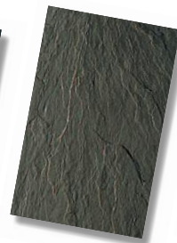
WEATHERING SEA GREEN