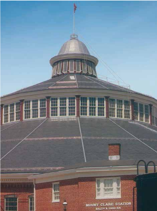
B&O Railroad Museum, Baltimore

North Country Slate is available in the following nominal thicknesses: