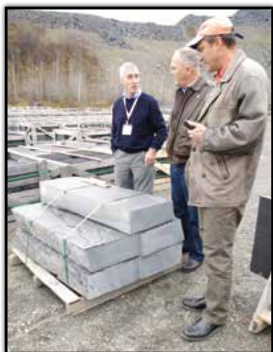
➤ An example of other slate building products by Glendyne Quarry.

NSA in 2002. The NSA was originally founded in 1922 and did some good work with its primary publication, Slate Roofs , but went inactive shortly after its founding due to, according to the NSA website, “a lack of cohesion in the industry.”