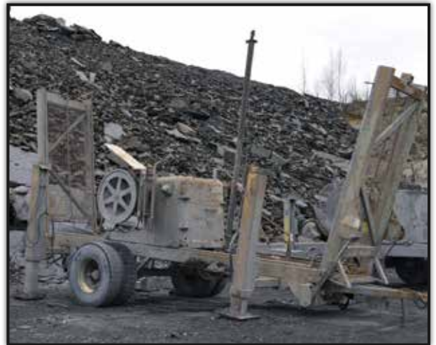
› Drilling rigs.

everyone has to do their part to keep the line moving, and a quality problem discovered too late in the process never ends well.