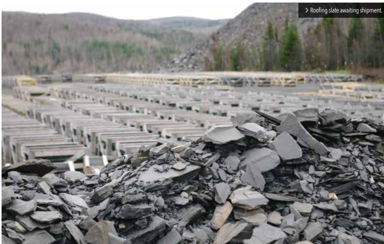
➤ Roofing slate awaiting shipment.

The Glendyne Slate Quarry is situated a three-hour bus ride northeast of Quebec City. A three-hour bus ride would not normally thrill me, but this one took us through some beautiful countryside all the way to the village of