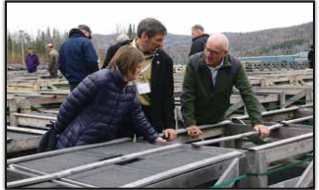
› NSA and APT members surveying finished roofing slate.

Speaking of craftsmen, Therrien told us there are 41 different jobs in the quarry and manufacturing operations. We were able to witness the workers focused on quality control at every level of the quarrying and production processes. Their work was largely repetitive-motion type work, but they all maintained a focus on their job at hand. As with any production operation,