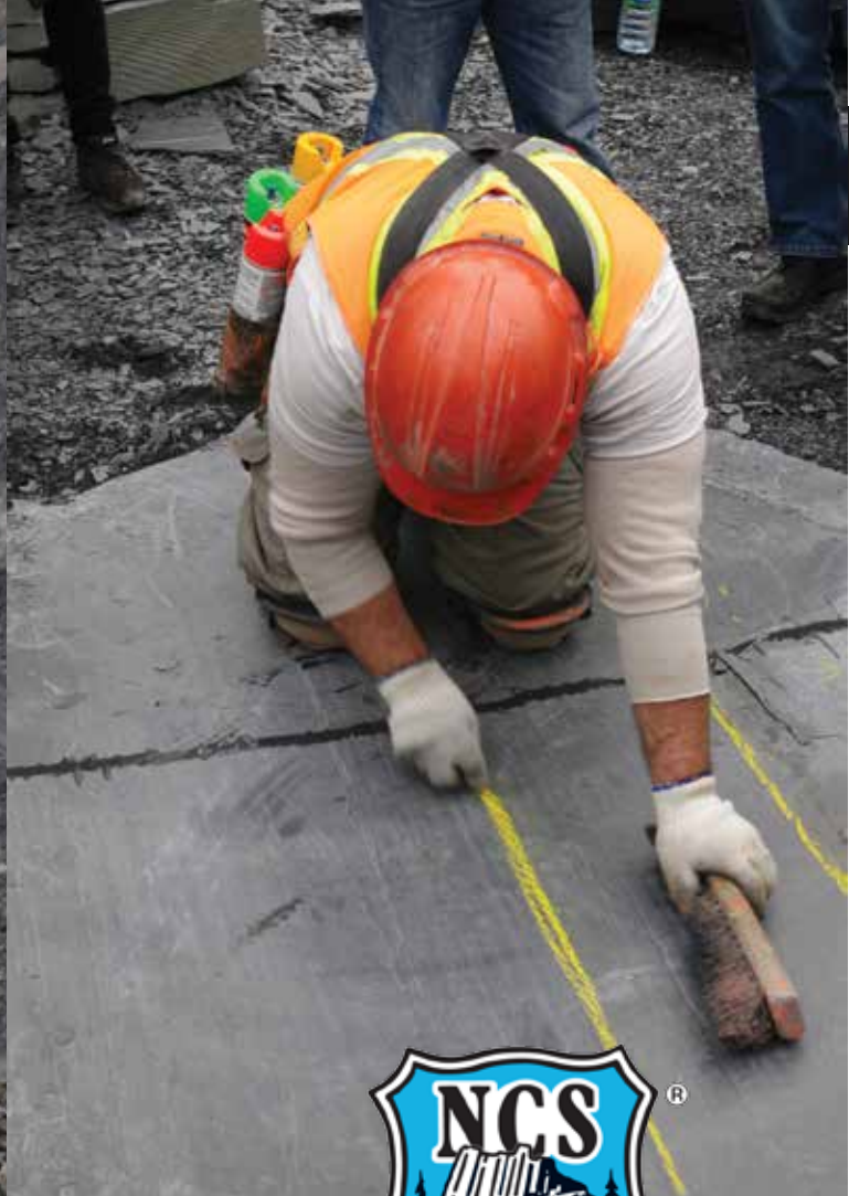
> Left: Glendyne Quarry operations. Right: Selecting and marking stone.