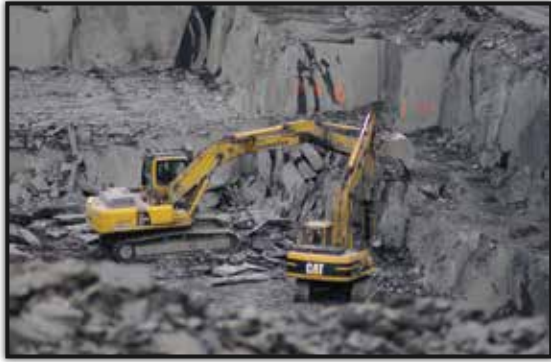
› Glendyne Quarry operations.

Saint-Mark-Du-Loc-Long, situated just outside the quarry. Of course, with a bus full of NSA and APT members, we were able to take advantage of making all manners of new friends and learning a thing or two about slating and construction techniques on historical preservation projects.